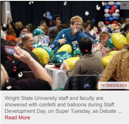
Wright State University staff and faculty are showered with confetti and balloons during Staff Development Day, on Super Tuesday, as Debate ... Read More

the event, which had a projected economic impact of $25 million. Instead, the university spent $2.5 million in state and university funds with no debate to show for it.