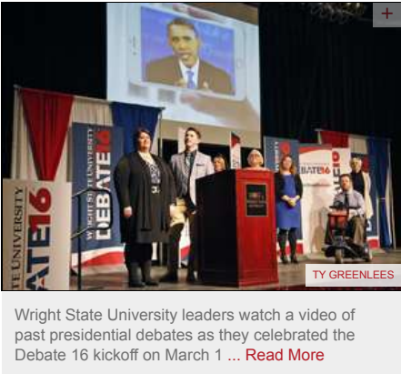
Wright State University leaders watch a video of past presidential debates as they celebrated the Debate 16 kickoff on March 1 ... Read More